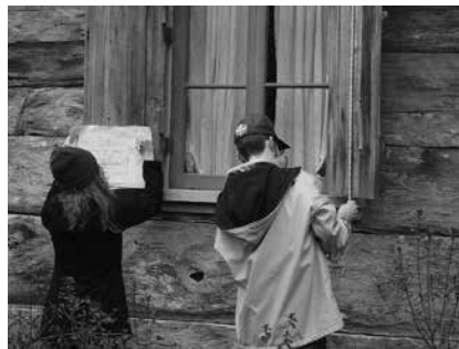
Building documentation workshop