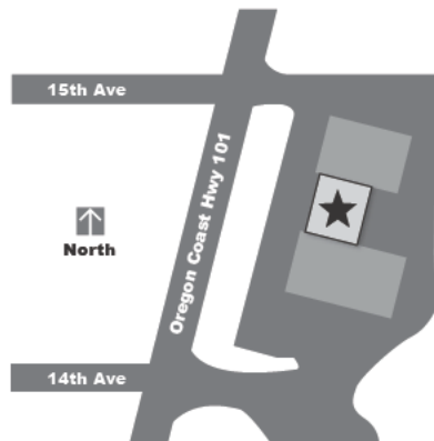
South County Campus / CEDR / SBDC (Seaside)

Lexington Campus: Clatsop Community College 1651 Lexington Avenue Astoria, OR 97103 503-338-2400 Fax: 503-325-5738 www.clatsopcc.edu Admissions: 503-338-2411 admissions@clatsopcc.edu