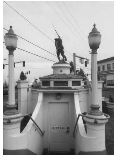
Doughboy Monument, Astoria OR

Location: IMTC Computer Lab, MERTS Campus