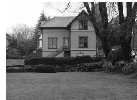
Flavel Carriage House, Astoria OR

Location: Doughboy Monument, W. Marine & Columbia